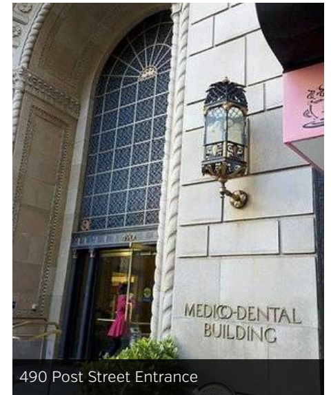
490 Post Street Entrance