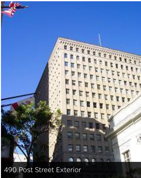
490 Post Street Exterior