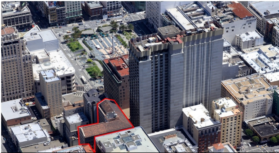
490 Post Street located in the Union Square Submarket