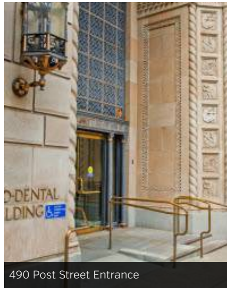
490 Post Street Entrance