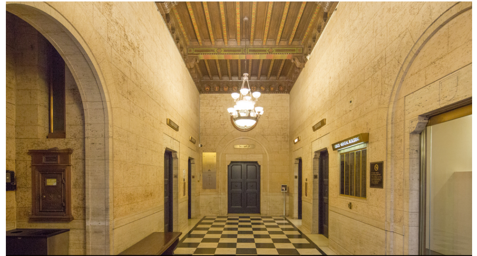
Magnificent Ground Floor Lobby Entrance